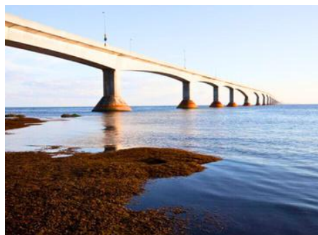
Chart your own course across Canada's storybook island. Touch down in Charlottetown, then wind past North Cape's red cliffs, the quirky Bottle Houses, and lighthouse-dotted Point East. Step into Anne's world at Green Gables and sink your toes into soft Singing Sands. Let ocean breezes guide you from farm-fresh seafood shacks to sunset-drenched beaches, every turn sparking share-worthy memories.